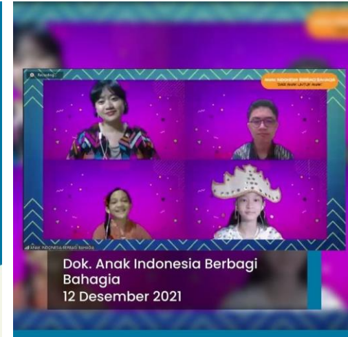
12 Desember 2021

“Pendidikan yang berkualitas dimulai dari usia dini.”