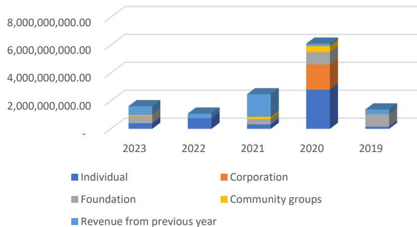
2023 Budget Allocation