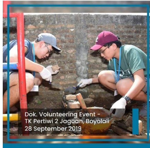
Dok. Volunteering Event - TK Pertiwi 2 Jagalan, Boyolali 28 September 2019

ars86care foundation ARS86CARE WEBINAR SERIES 2023 THE HERO WITHIN YOU 2